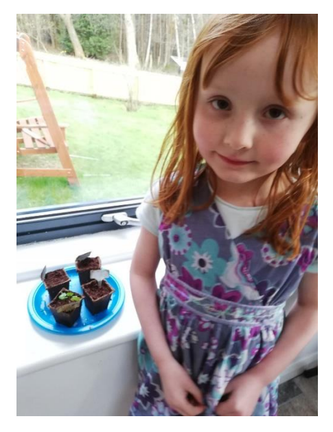
On Tuesday at 11 O'clock I watered my seeds and in the afternoon I built a fairy house with my sister.