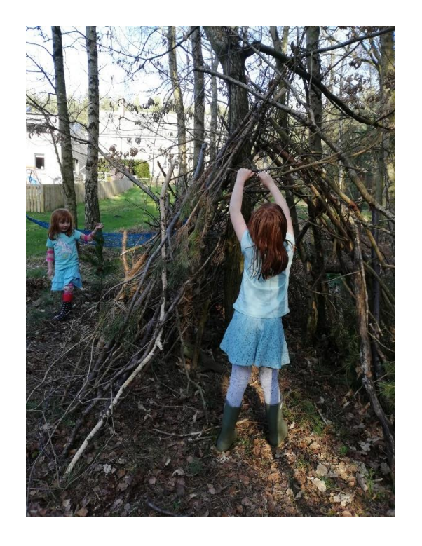
On Wednesday we built a den at 3 o'clock.