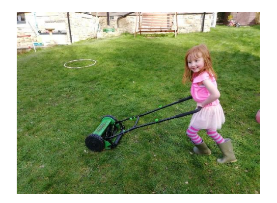
On Monday in the morning I cut the grass.